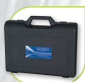
Hard Carry Case (56X259306)