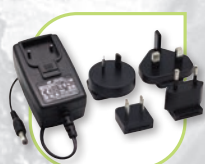
Power Adapter (60X426401)