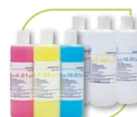
Colored & Colorless Buffer Solutions (ECPHBUFKITC) (ECPHBUFKIT)