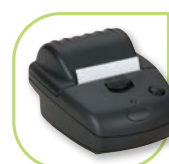
RS232 Thermal Printer (01X594301)