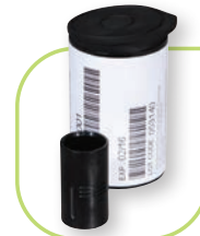
RDO Sensor Cap