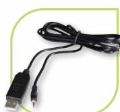
USB Cable (MINIPHONEUSB)