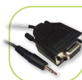
RS232 Cable (30X427301)